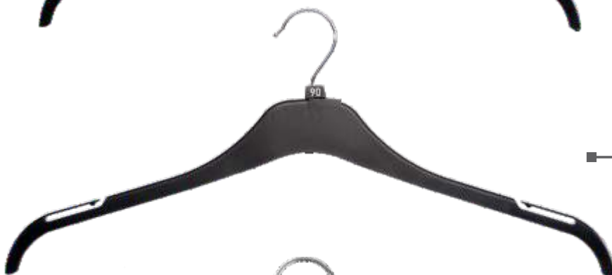
— TUM47BL 470mm