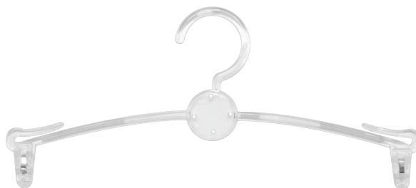
H89ACL Clear 280mm