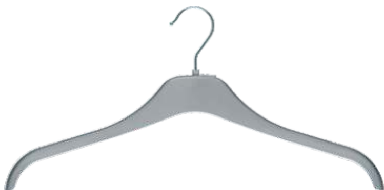
— KUM41SI Silver 410mm