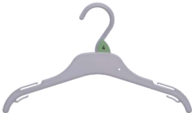
■ TC30PL Pearl 300mm