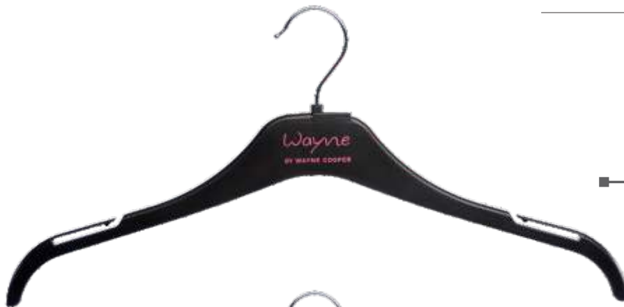
TUM47 PRINTED 470mm See website for availability of prints

APPLICATION | Branded Ranges. Tops, Shorts, Knitwear & Pants