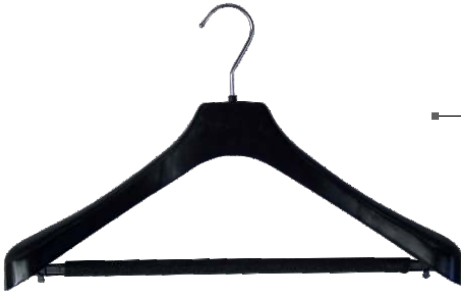
■ ————— SU65BL 460mm