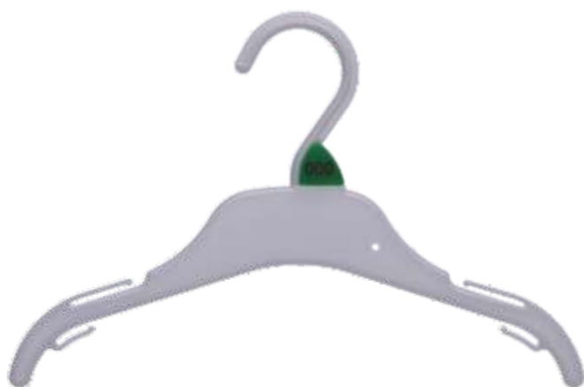
■ TC26PL Pearl 260mm