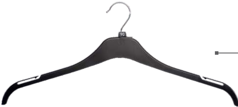
— TUM47BL 470mm

APPLICATION | Tops, Shorts, Knitwear & Pants