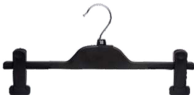
— BUM33BL 330mm