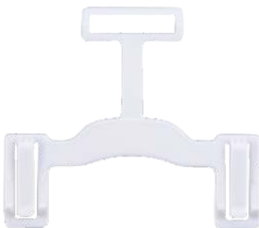
— PC19LPL Pearl 190mm