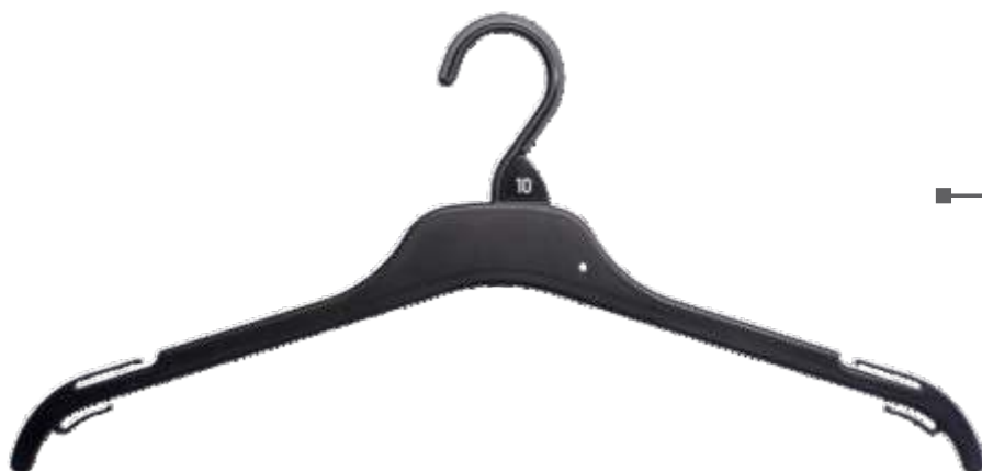
— TC41BL 410mm