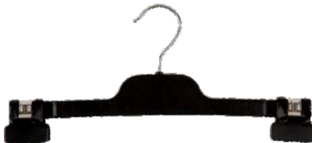
4473BL Black 320mm