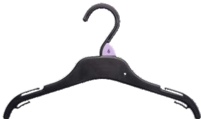
■ TC26BL 260mm

APPLICATION | Tops, Dresses, Knitwear, Jackets, Rompers, Overalls, Spencers & Sleepwear