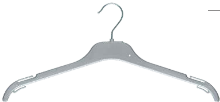
— TCM41SI Silver 410mm

APPLICATION | Pyjamas, Nighties, Dressing-gowns & Sets