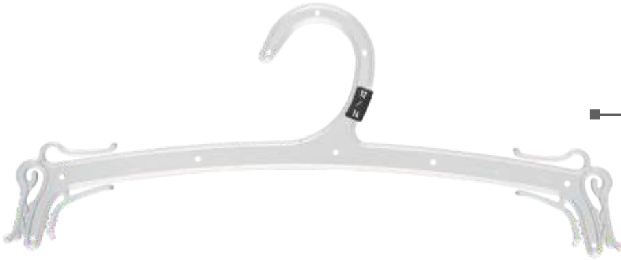
— LH285CR Clear 285mm

APPLICATION | Briefs, Bras, Camisoles & Lingerie Sets