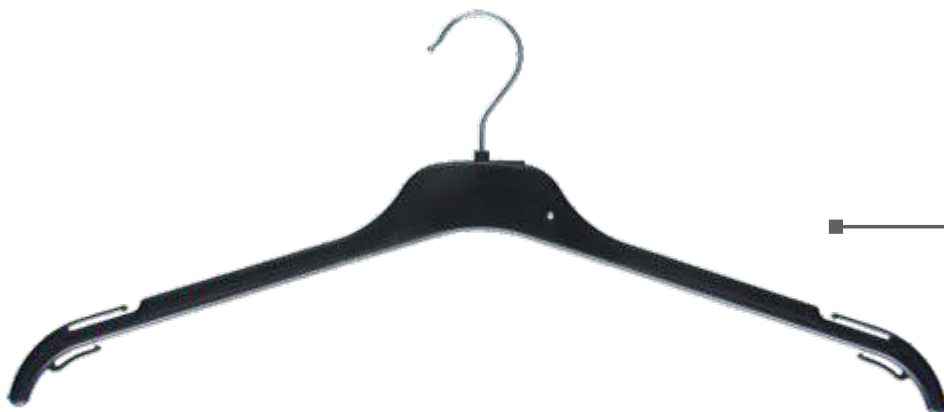
■ TCM46BL 460mm