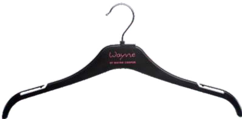
TCM46 PRINTED 470mm See website for availability of prints

APPLICATION | Branded Ranges. Jeans, Pants & Shorts