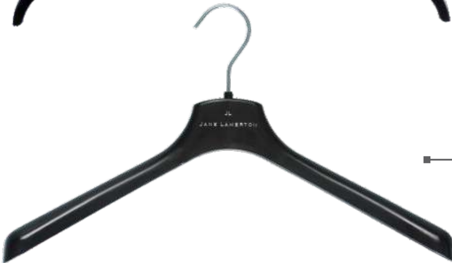
4489 PRINTED 420mm