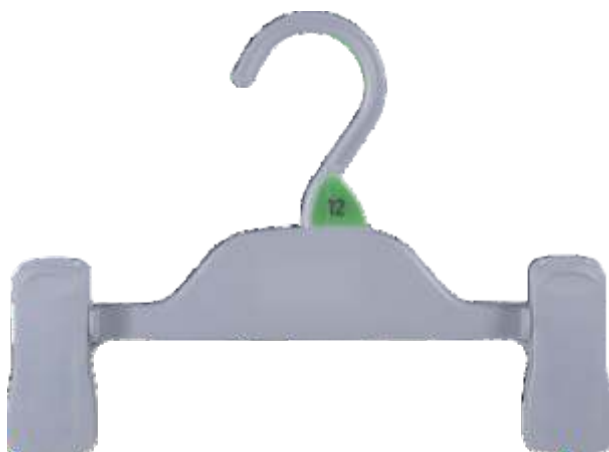
BC22FCPL Pearl 220mm