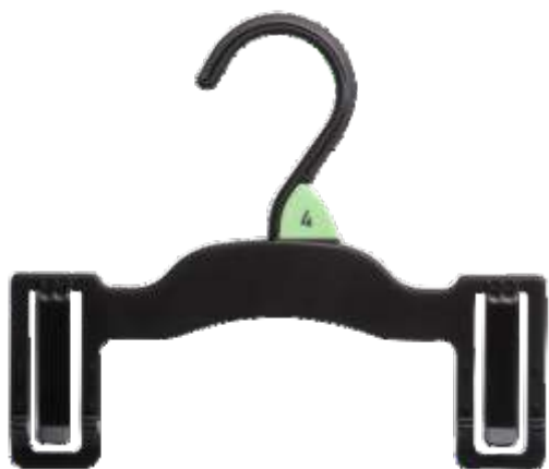
— PC19BL 190mm

APPLICATION | Pants, Skirts, Shorts & Sets