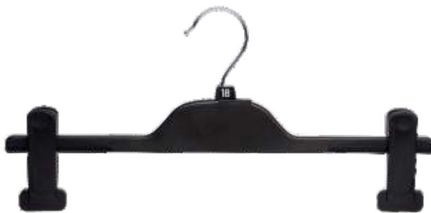
— BUM33BL 330mm