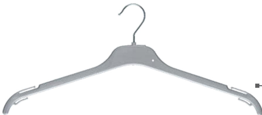
— TCM46SI Silver 460mm