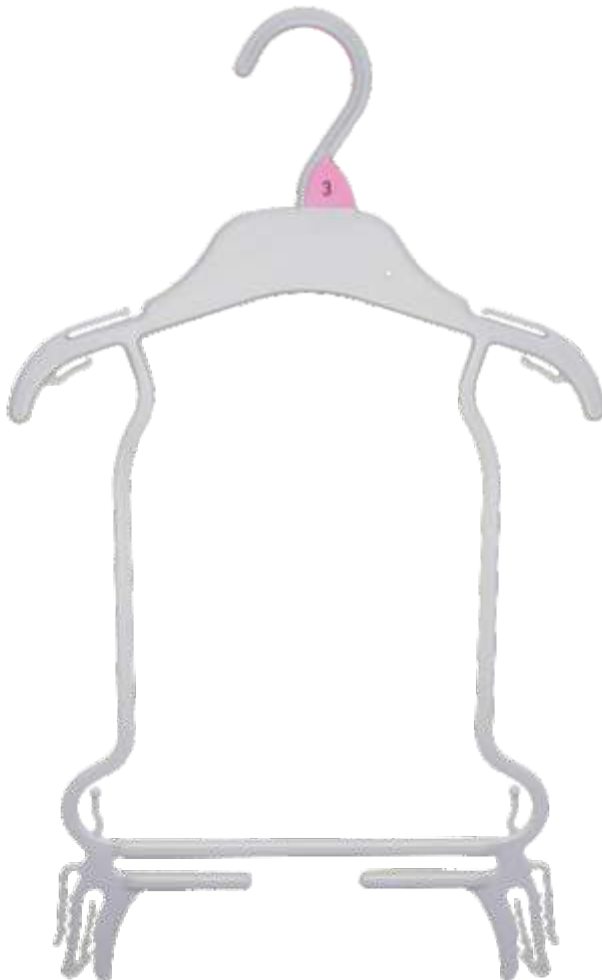
— FC26PL 260mm