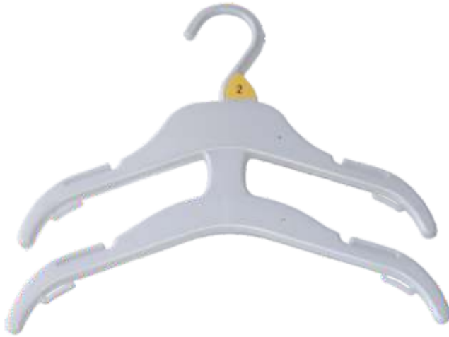
— DTC26PL 260mm

APPLICATION | Tops, Dresses, Knitwear, Jackets, Rompers, Overalls, Spencers, Sleepwear & Multi-garment