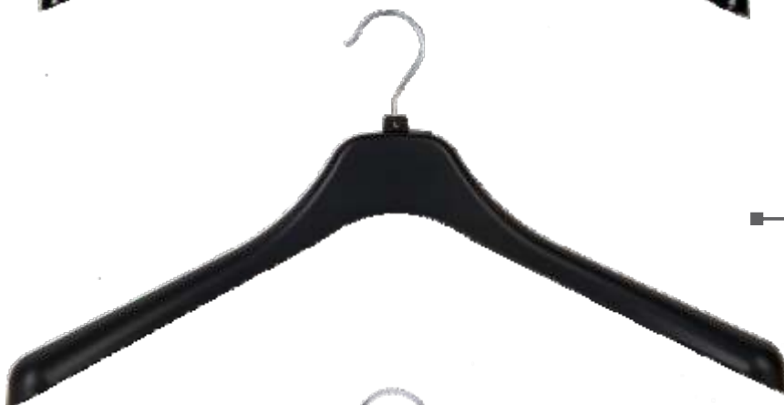
— JUM46BL 460mm