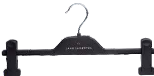
BUM33 PRINTED 330mm

APPLICATION | Branded Ranges. Jeans, Pants, Skirts & Shorts