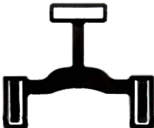
— PC19LBL 190mm