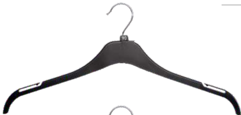
— TUM41BL 410mm

APPLICATION | Tops, Shorts, Dresses & Knitwear