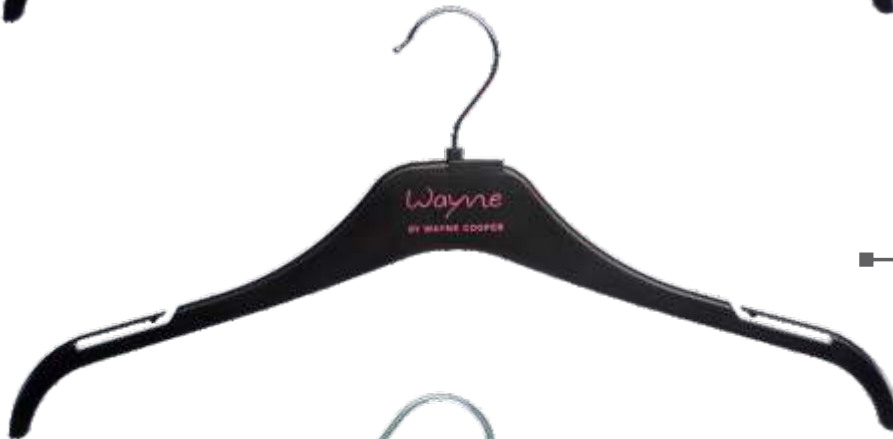
TUM47 PRINTED 470mm