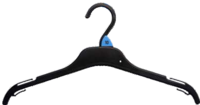
— TC36BL 360mm

APPLICATION | Tops, Dresses, Knitwear, Jackets, Rompers, Overalls, Spencers, Sleepwear & Multi-garment