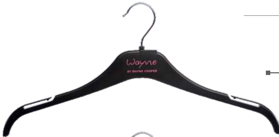
TUM41 PRINTED 410mm

APPLICATION | Branded Ranges. Tops, Shorts, Dresses, Knitwear & Pants