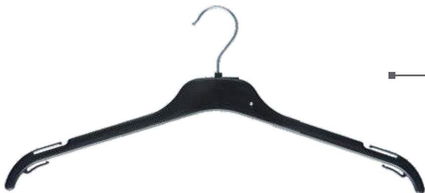
■ TCM41BL 410mm

APPLICATION | Tops, Shirts, Dresses, Lightweight Jackets & Knitwear