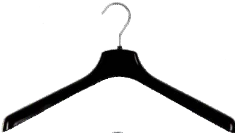
— 4489BL 420mm