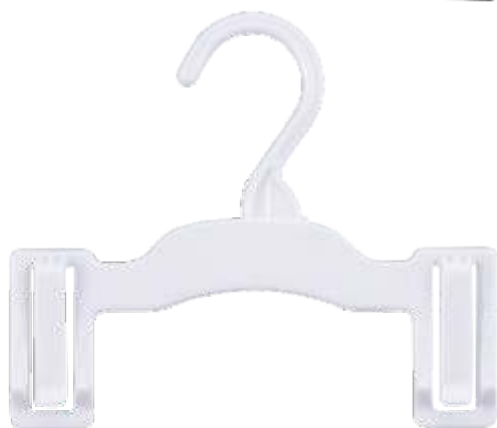
— PC19PL Pearl 190mm