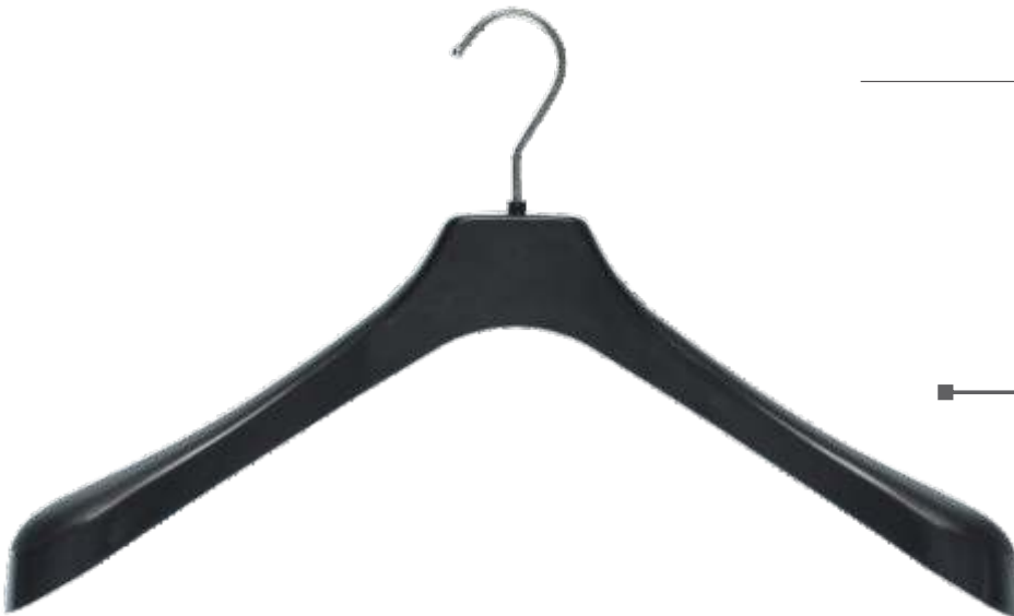
■ ————— SU86BL 450mm